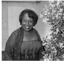
Words from the Director