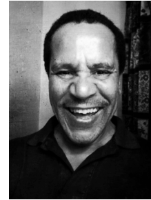
Les Howard (Brook Benton)